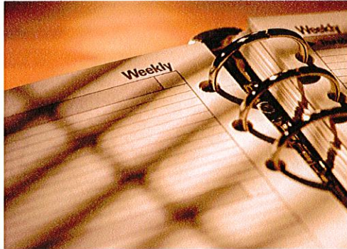
Mark your calendar with important ABEMFT Dates in 2013

The above are ABEMFT's regular Board Meetings and are open to the public for observation. The Chair may call special Board Meetings or reschedule as needed. Any change to the above dates will be advertised in advance of the Board Meeting at www.mft.alabama.gov and on the Secretary of State's web site located at www.sos.alabama.gov in accordance with the Alabama Open Meetings Act.